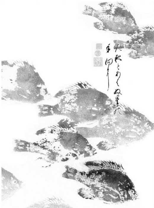
Fred B. Mullett

Nature printing is a simple technique that uses inks or pigments to transfer images of nature to paper, cloth or other surfaces. The graceful contours and delicate surface relief of plants and animals, rocks, and other natural objects serve as patterns for prints that capture the striking beauty of nature.